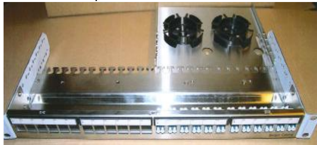
BC-13-207 24 port 2 HU For Fusion splicing