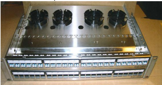
BC-13-205 12 port 1 HU for Field termination