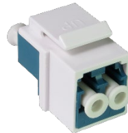
LC SM Duplex adapter