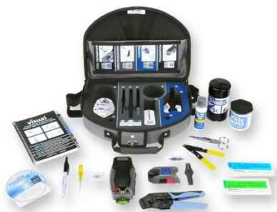
UniCam® High-Performance Installation Toolkit