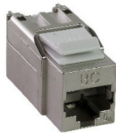
Cat6A STP DNV connector