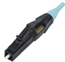
Unicam LC SM connector