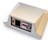
BC Outlet 1xRJ45 STP Cat6A Keystone + Duplex LC 9/125

Bergen Cabling Maritime LAN Concept by Sohome AS Grimstadvegen 93 N-5252 Søreidgrend Tel: +47 55 31 27 00 e-mail: sales@sohome.no