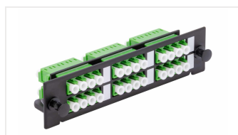
L-Series Adapter Plate