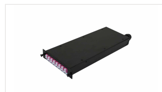
L-Series Splice Cassette