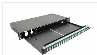
S03 1RU Black Sliding Patch Panel - 24 Position LC/SC/E2000 up to 48 fibers