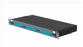
L-Series S13 1RU Sliding Patch Panel