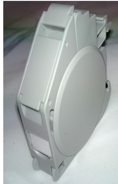
BC DIN Outlet with Dust cap and side cover