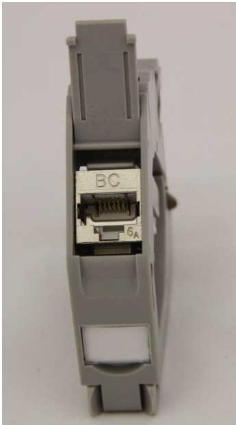
BC DIN outlet with Cat.6A Connector