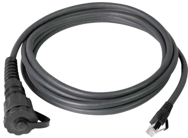
Bergen Cabling IP67 to IP20 Patchcord