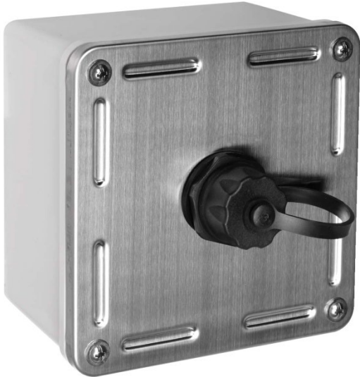
Bergen Cabling IP67 Wall Outlet 1x Cat.6A