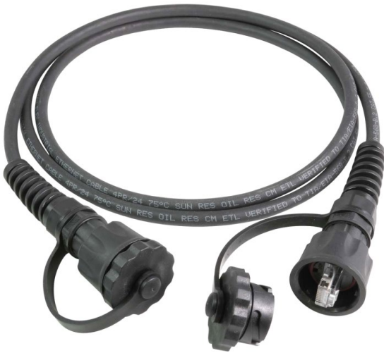
Bergen Cabling IP67 to IP67 Patchcord