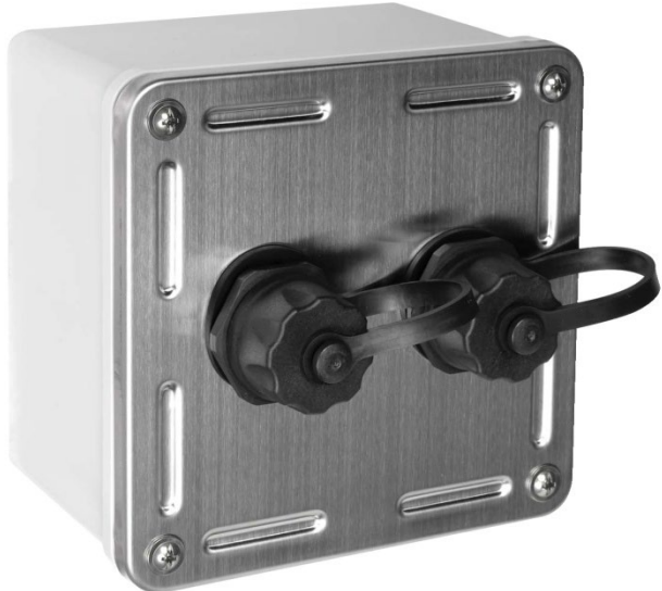
Bergen Cabling IP67 wall outlet 2x Cat.6A